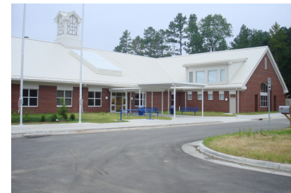
Morris Grove Elementary School

The district was chartered by the North Carolina General Assembly on this date in 1909. The year-long celebration offers many events and opportunities for promoting the historical significance, preserving the memories and showcasing the tangible contributions of public education in our towns.